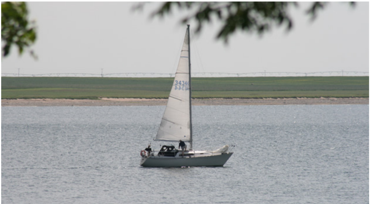
Sailing is one of the most popular pastimes on Lake Diefenbaker.

Elbow is a joint with a surprising resort feel